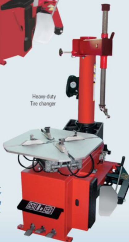
Heavy-duty Tire changer

SWING ARM DESIGN - HANDLES TIRES TO 47" DIAMETER AND RIM WIDTHS TO 15".