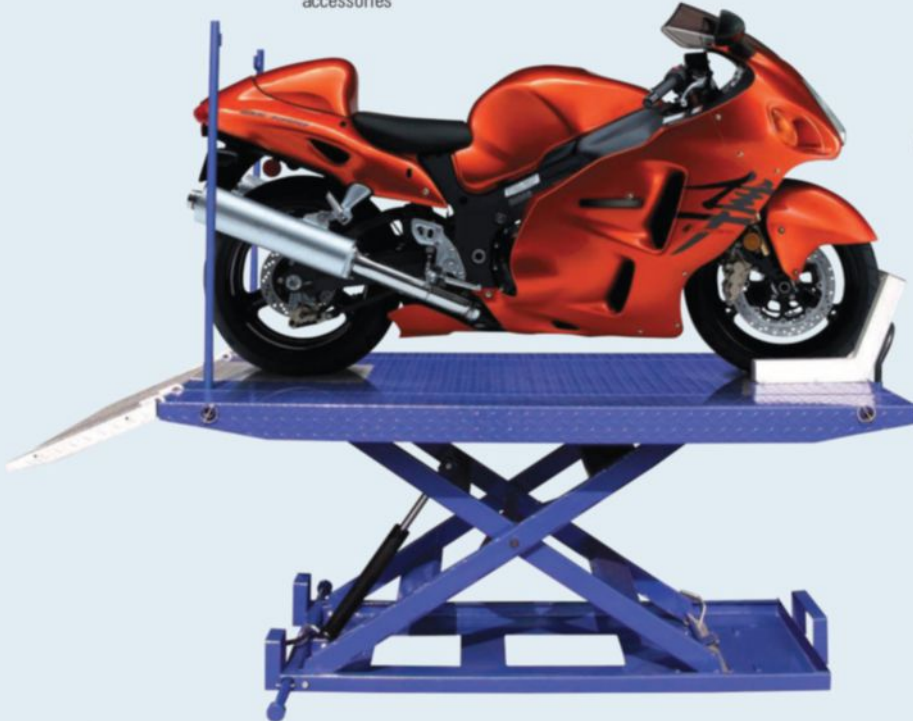
Motorcycle lift shown with standard accessories